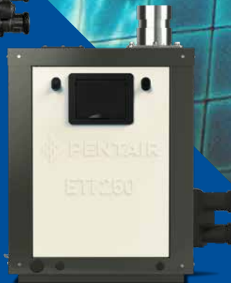
ETi 250 High-Efficiency Heater