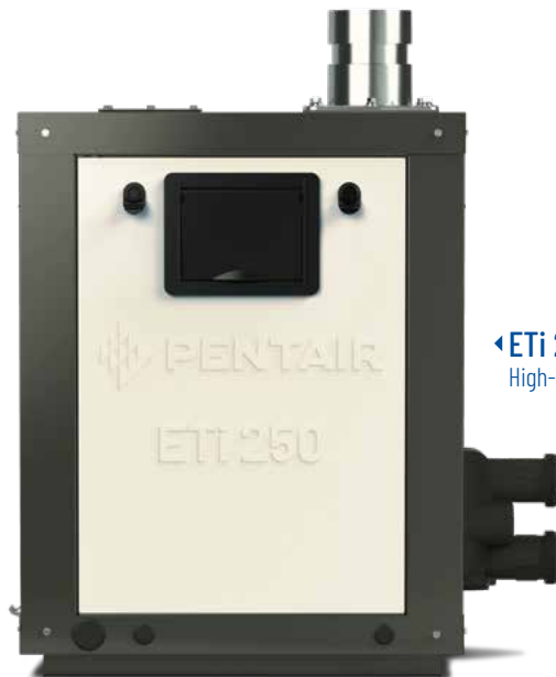
◀ ETi 250 High-Efficiency Heater