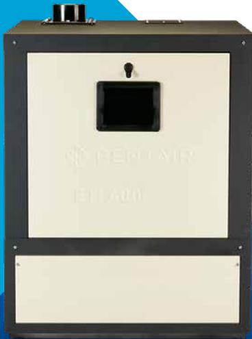
ETi 400 High-Efficiency Heater