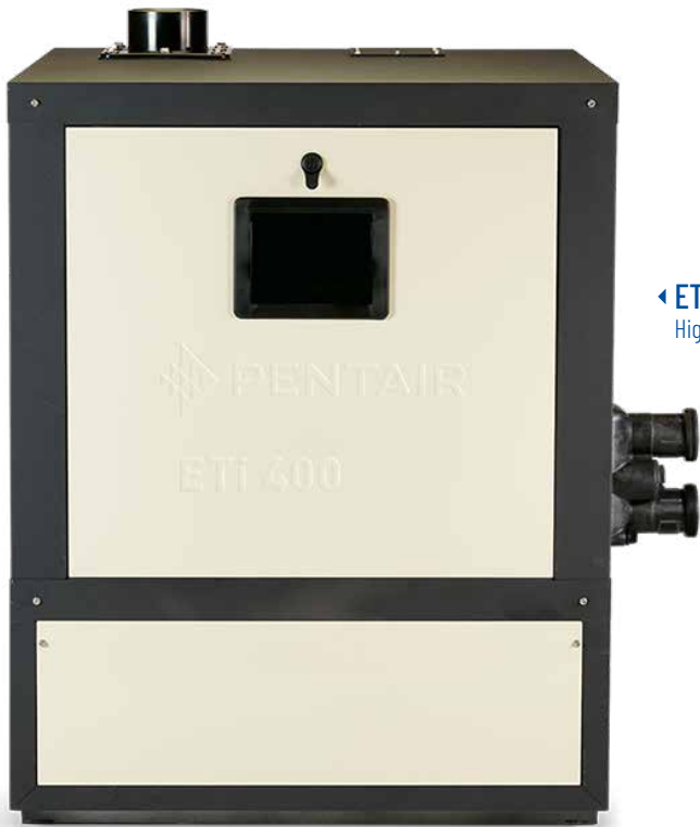
◀ ETi 400 High-Efficiency Heater